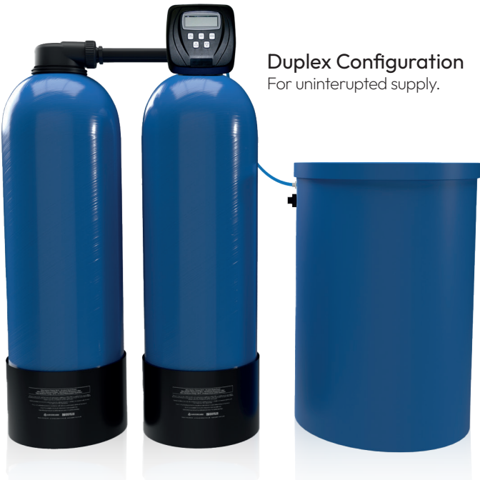
Duplex Configuration For uninterrupted supply.