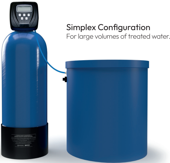
Simplex Configuration For large volumes of treated water.

These units are made to order. Speak to a representative for more information. Call 01279 780250.