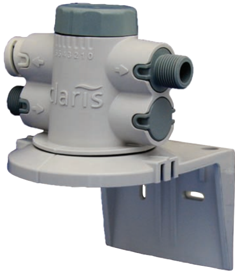
Clariss Single Head: EV4339-21

Filter head with 3/8" BSP fittings exclusively for Clariss replacement cartridges